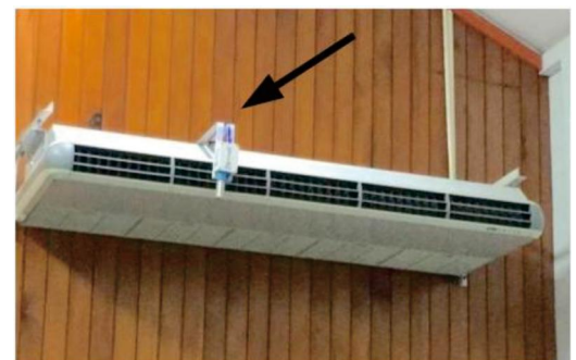
Split Aircon Installation