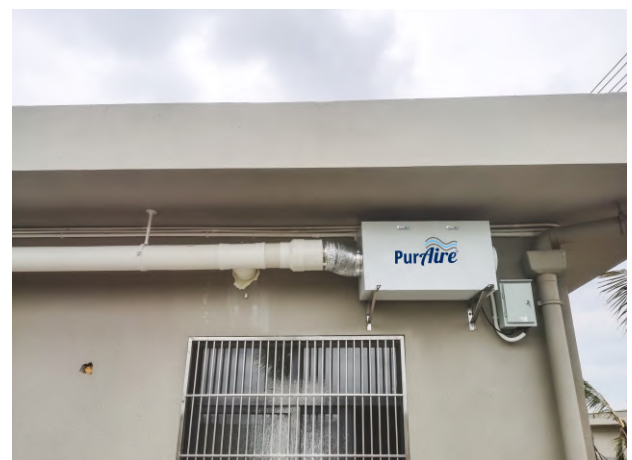
Typical External Installation